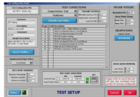
Sample Test Configuration Screen

The Software Program for the Universal Testing Machine is automatic. Once the Test Configuration menu has been programmed, "Start" button is pressed, initiating the test. The results of the test are displayed on the PC in real time. They can then be saved and/or printed for later use.