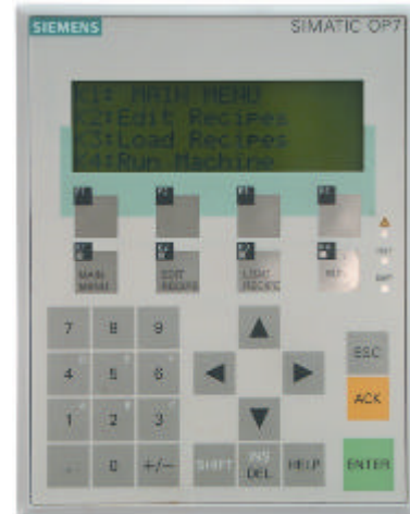
Programmable Control Panel